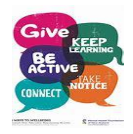
The 5 ways to wellbeing to prioritise our mental health and support us through the exams.